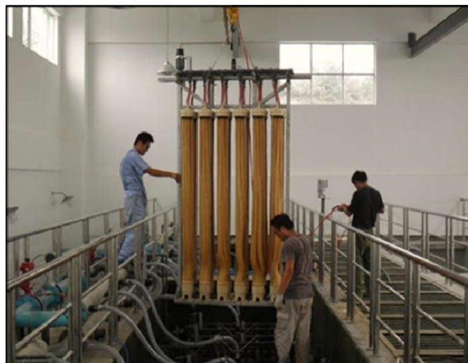
Figure 1 : Installation of the hollow fiber membrane in MBR wastewater treatment plant

landscape fountains are regularly replaced by the remaining water, using the terrain drop and the pump all collected for secondary reuse. Over the years, we have continuously increased investment, invested 13 million yuan to complete the civil infrastructure of the MBR membrane bioreactor with a 4000 cubic meters daily processing capacity, installed 2000 cubic meters per day of treatment equipment and successfully put into operation in September 2011. The Figure 1 presents the installation of the hollow fiber membrane in MBR wastewater treatment plant in Xi'an Siyuan University.