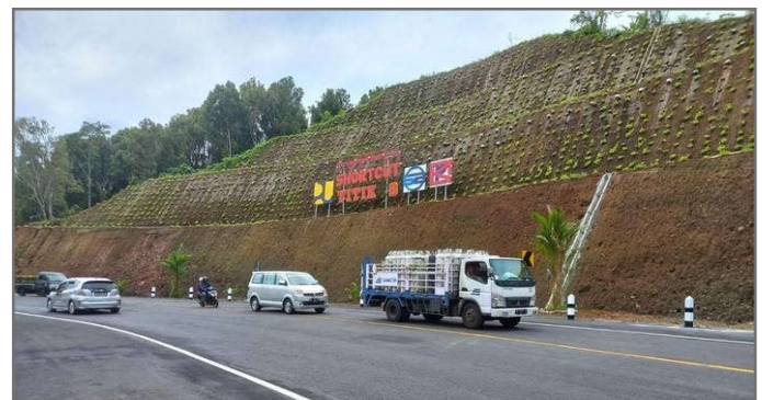
Figure 01 : The Singaraja-Mengwitasi Shortcut Project