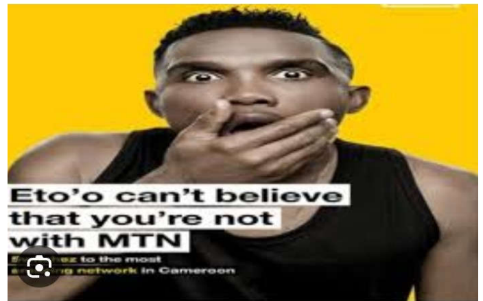
Picture taken at Ndokoti on the 25 th of June, 2024

Showing Samuel Eto'o a football celebrity, testifying about the services of MTN Cameroon