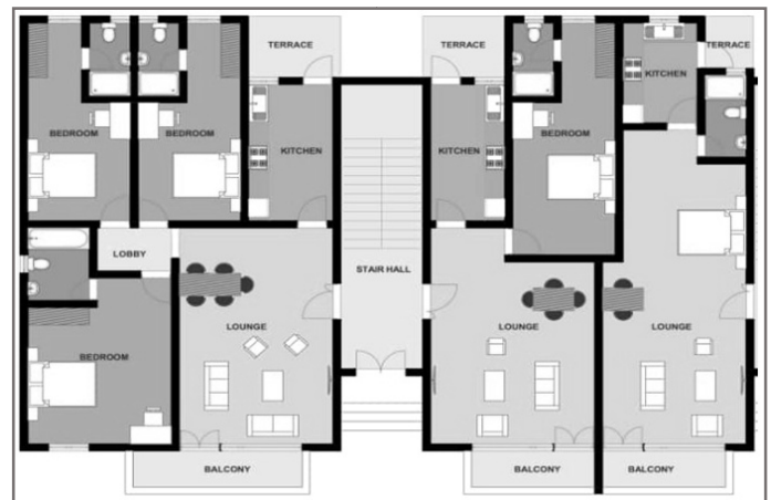
Figure 5: Floor plan for four one-bedrooms around a central stair and landing.

Observing basic best practices for plumbing can help to regulate costs. When designing a unit, stacking hydro walls for kitchens and bathrooms vertically and placing them back-to-back reduces plumbing complexity and price. Elevators are expensive-to-service line items on a project budget and building codes dictate when elevators are required; typically, buildings above three stories and/or over 12 units. In some cases, the advantages of building a bigger project with elevators will justify the extra costs. For a few smaller projects, it should be possible to scale back or eliminate elevators while still creating an accessible building. For instance, during a single-stair building, four units surround one, central staircase. Ground floor units are accessible, and with no quite three floors, a 12-unit building can have most of its space dedicated to living, instead of circulation.