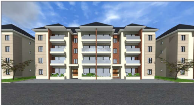
Figure 1: Elevation showing the use of different textures and arrangement of the facade of a proposed social housing unit.

It is essential for façade materials to be durable, visually appealing, and supportive of environmental objectives. Therefore, design guidelines will often involve a combination of materials and encourage other styles of manipulating facades while creating variation. These features are capable of making construction more expensive especially when the length is added to the façade, thereby, increasing complexity. A less expensive way to create dynamic facades is to pair simple, regular facades with a couple of visual shifts and a mix of high and low cost materials. A warm entrance or an angled exterior wall creates visual interest without substantially increasing facade complexity and length. In some projects, materials not typically related to residential construction like corrugated metals have created cost savings. In others, a low cost material is employed for most of the facade, while the ground floor or another key element has another material to differentiate it. Figures 1 and 2 below show the use of different textures and arrangement of the facade of a proposed social housing unit in Greater Port Harcourt City.