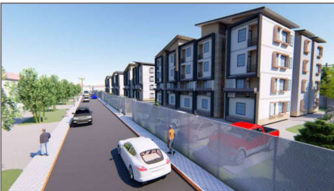
Figure 2: 3D drawing showing the use of different brick colors and textures on the facade of a proposed social housing unit in Greater Port Harcourt City. Source: (Reseacher, 2021)