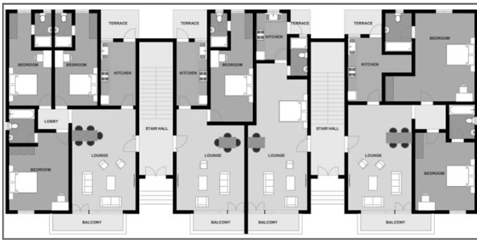
Figure 3: Floor plan showing reduced circulation spaces and combination of wet walls where necessary.