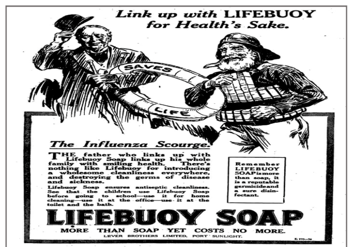
Fig4. An advertisement of Lifebuoy soap during Spanish Flu (1918)