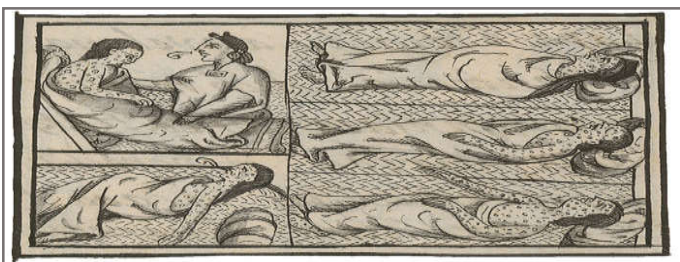
Fig2. 16th Century Small Pox by an indigenous Aztec artist

Small Pox had caused severe pandemic in sixteenth century in chiefly the native American States of Northern plains, Mexico, Peru and Easter Islands. This was an exotic disease to the Native Americans brought onshore by the Spanish conquistadors from old world Europe. This dreaded disease had claimed more lives than the war between the invaders and inhabitants had done. A Vietnam war veteran, R.G. Robertson has experienced the woes of forced invasion and laced his vivid description with that sensitivity of how the American Indians had almost faced extinction due to the dreading Small Pox infection during the 1837-1838. In the spring of 1837, an American fur company steamboat, the S.S. St. Peter, had docked on the Missouri river which was the native place of Mandans, Hidatsas, Blackfeet, Arikaras, Assiniboins and other tribes. One of the crew was already infected and soon it spread to three Arikara women, from whom the disease spread like forest fire among others. Fig2 projects the painting by an Aztec artist.