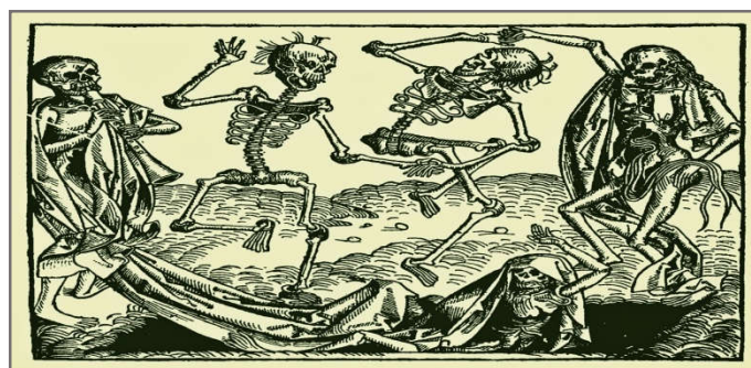
Fig1. La Danse Macabre (Dance of Death) by Michael Wolgemut (1493)

Way ahead of contemporary mediaeval literature, this compilation has been noted and annotated down the centuries for its sophisticated, lucid narration and dramatic style, vivid and realistic descriptions of people's lives from all strata of society and always bringing up the optimistic and witty aspects of human life in that horrific time of