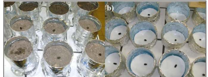
Figure 2: Germination pots