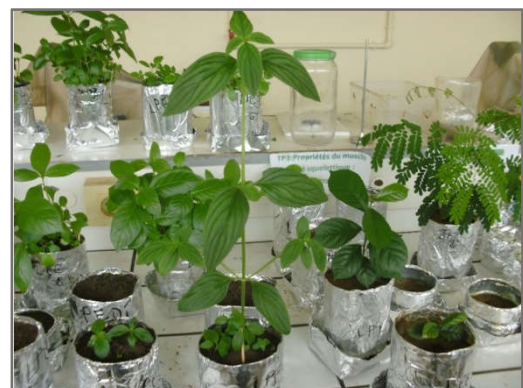
Figure 3: Grown plants

Of the 30 pots that successfully germinated, a total of seven (7) plant taxa were identified: four (4) known families and two unidentified taxa